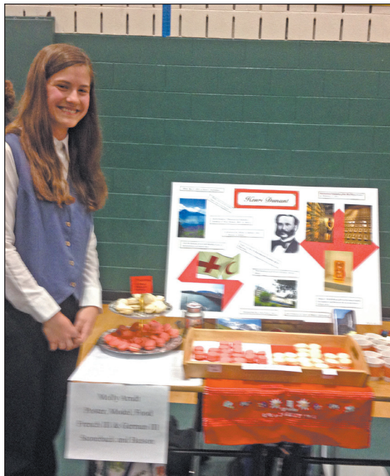
Molly A.'s presentation from last year included some tasty treats.

If you plan to attend, please plan to carpool to conserve parking as much as possible.